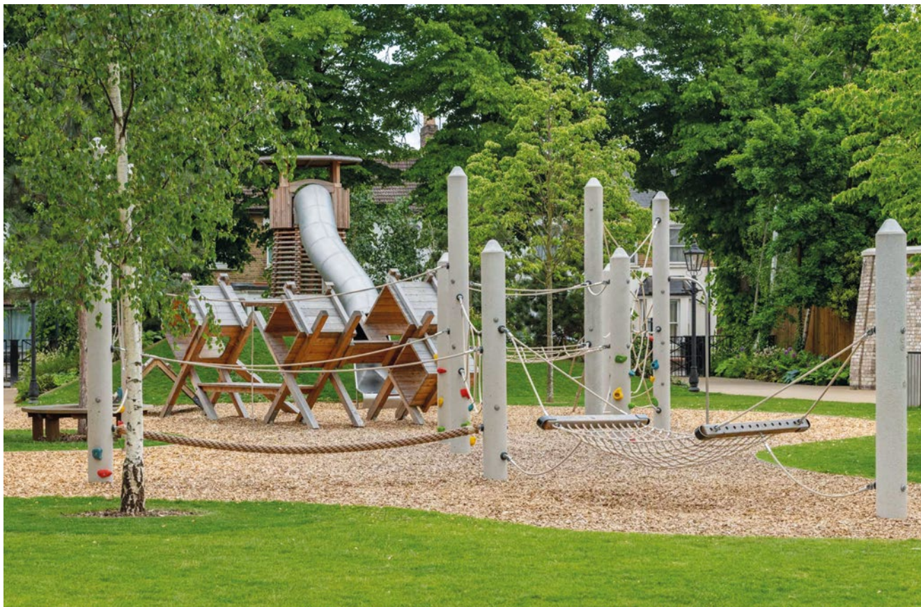
The standard colour of ropes red