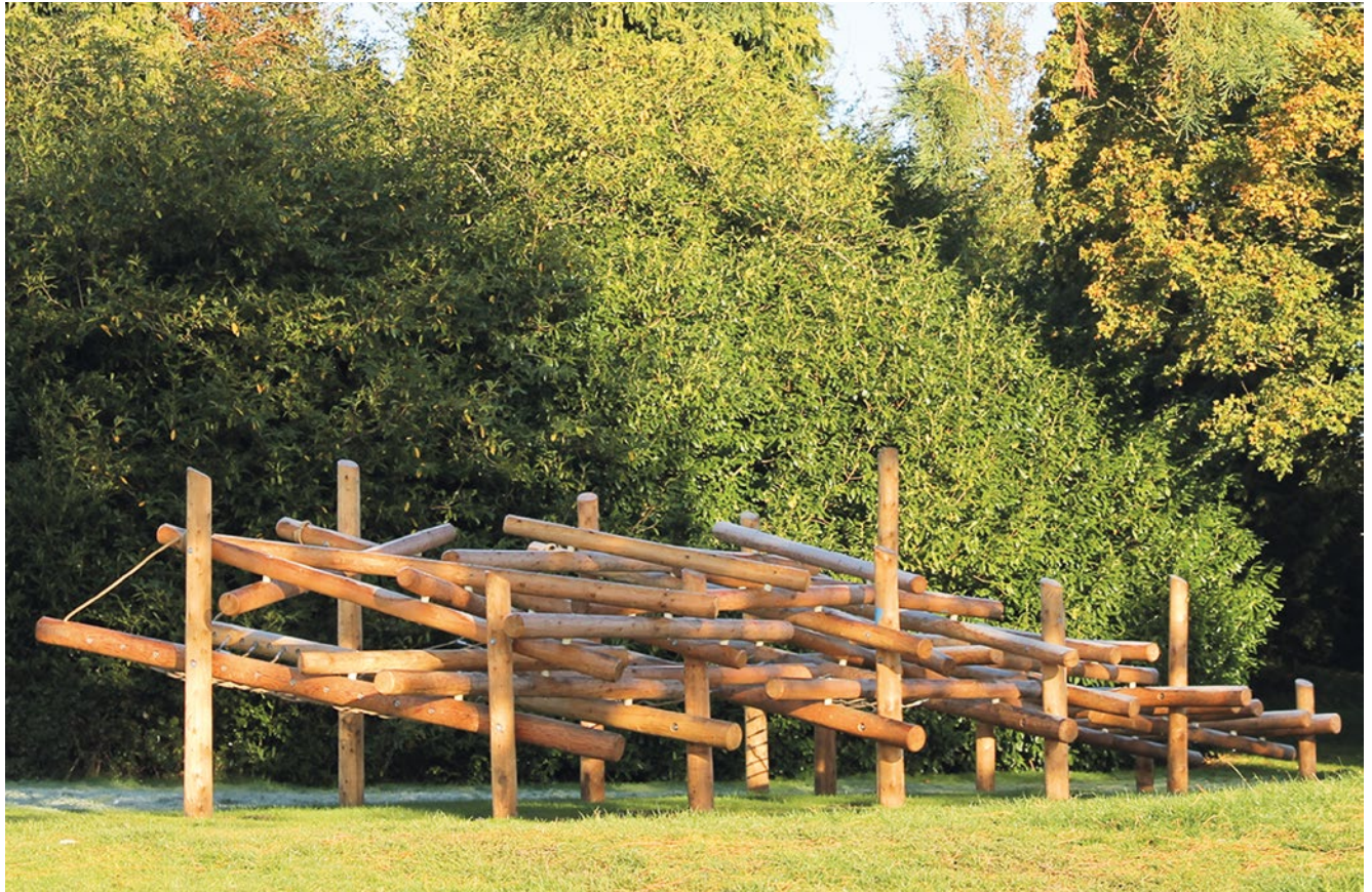
Climbing Structure 16