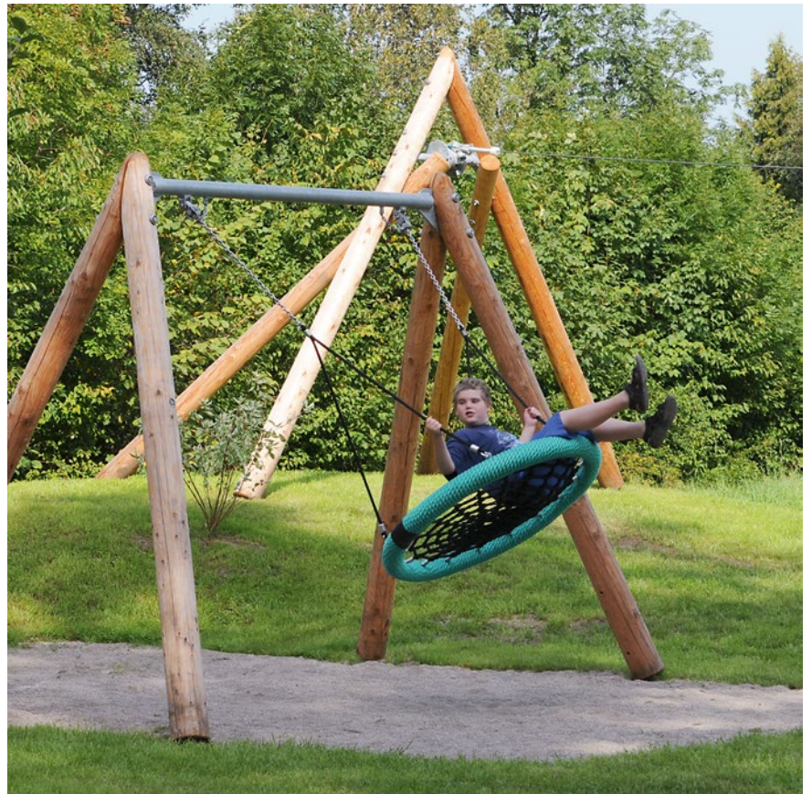
Swallow's Cradle Nest special