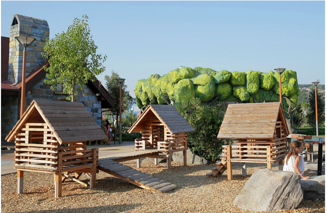
Order No. L4.10900 made of larch